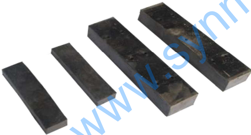
Rubber resistance plate

(by rubbing between grinding wheel, sieve and rubber resistance plate , the grain will be hulled. )