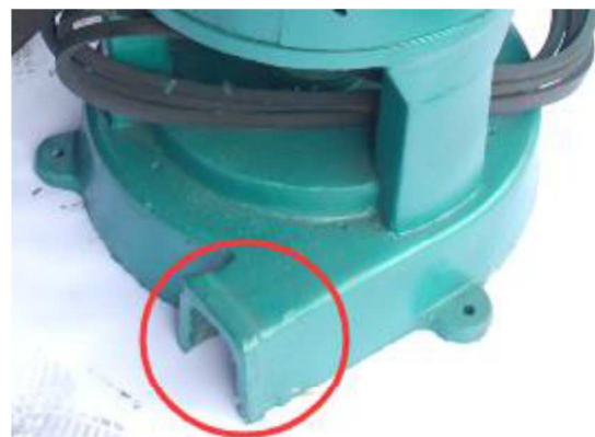
Air Blower/Outlet of husks

The husks suction mouth can suck the husks separated from hulled grain.)