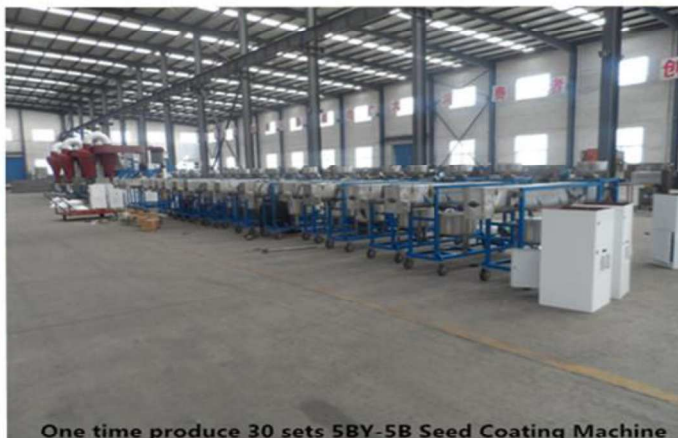
One time produce 30 sets 5BY-5B Seed Coating Machine