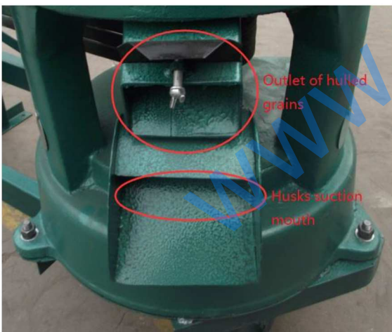
Outlet control plate and Husks suction mouth

(To control the hulling results by enlarge or narrow the hulling chamber )