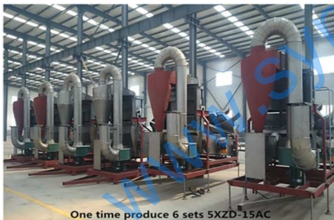
One time produce 6 sets 5XZD-15AC