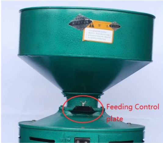
Feeding control plate

(to control the feeding volume and speed)