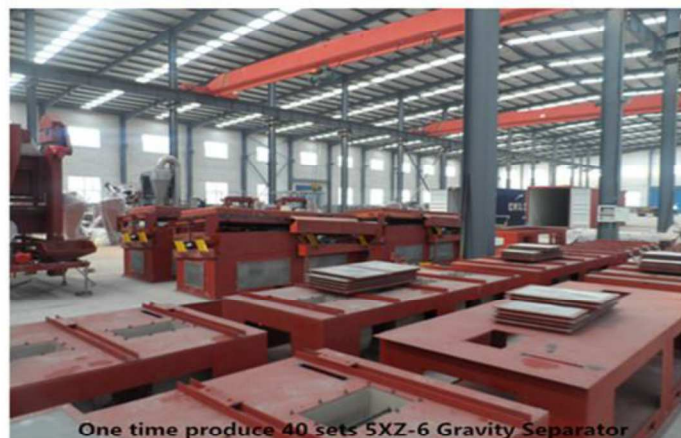
One time produce 40 sets 5XZ-6 Gravity Separator