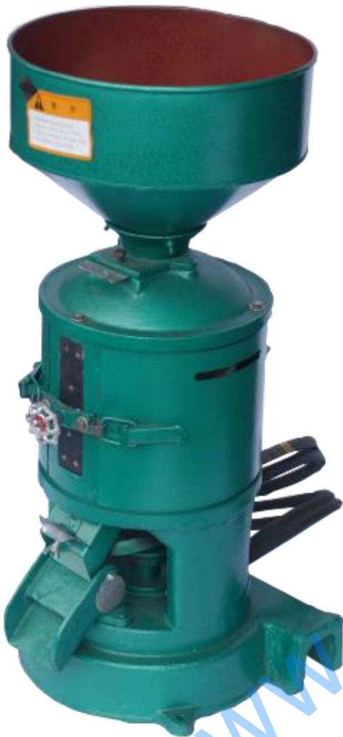
TYT-200 Grain Huller