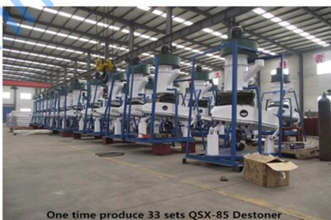
One time produce 33 sets QSX-85 Destoner