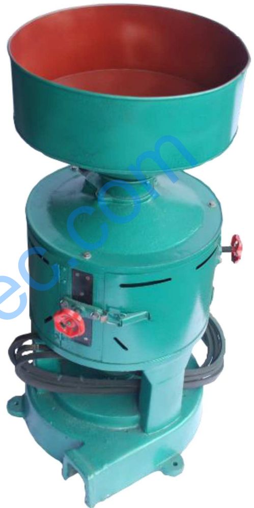
TYT-350 Grain Huller