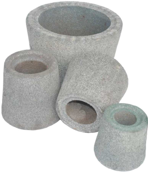
Grinding wheel (different size for different models and grains)