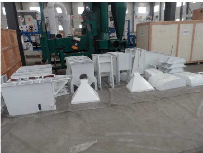
New DTY Bucket Elevator parts

For bottom grain changing cup., We used good design for it, There is two small screws for fixing it. When remove two clips, It can open outlet and can remove the bottom grain easily when you want to process next grain.