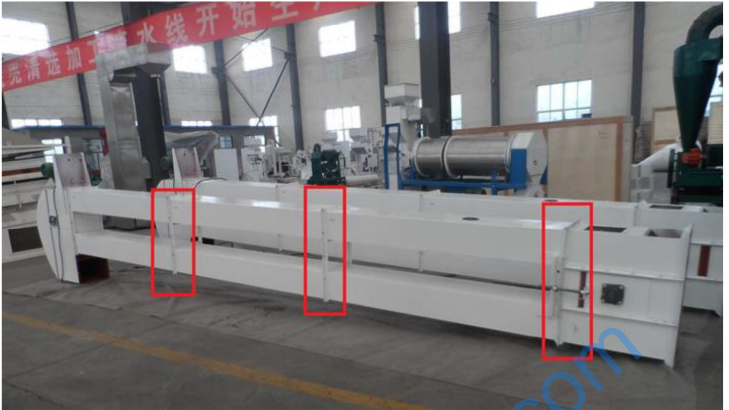
Nesting Board designed to Prevent dust leakage from the inside bucket elevator body. It can protect working environment as well.