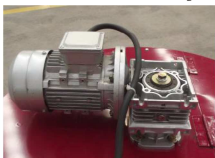
Chemical tank motor 0.37KW