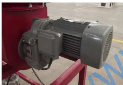
Soft auger motor 1.5KW