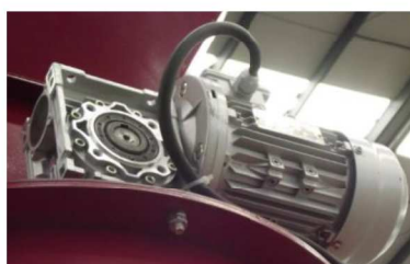
Feeding motor 0.75KW