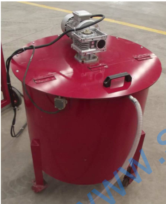
Mobile stainless steel chemical tank (304)

It is used for remove the sticky liquid chemical from the sides of primary mixing tank.