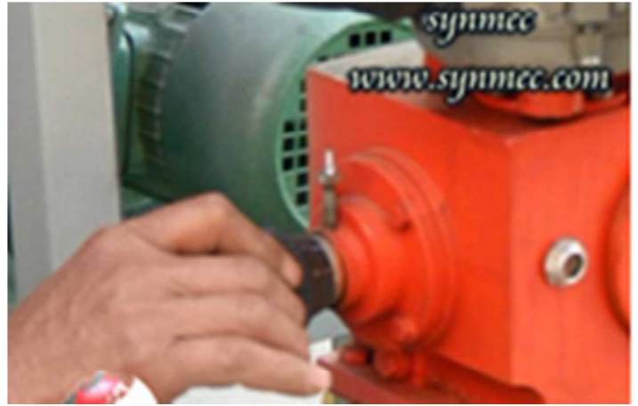
Dosing pump control chemical amount precisely