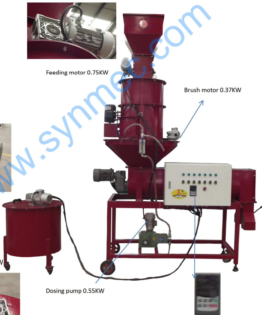
Dosing pump 0.55KW