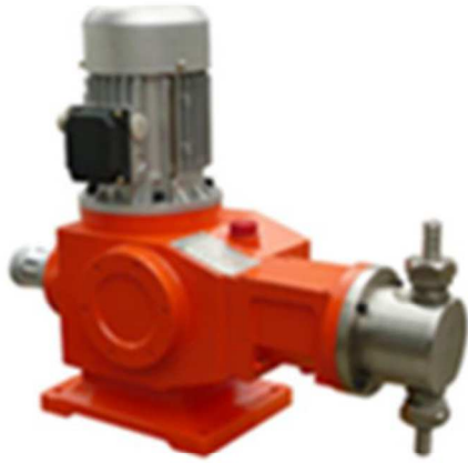
Dosing pump & motor Pressure: 0.5Mpa Power: 0.55Kw