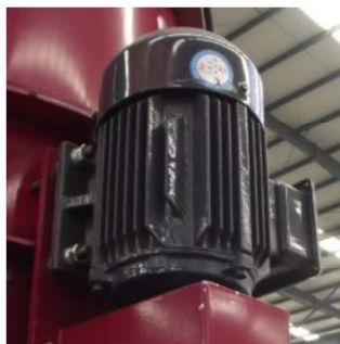
Centri disc motor 0.55KW